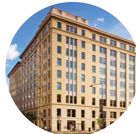
Archives of American Art