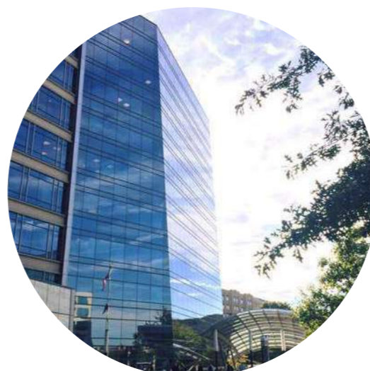
Smithsonian Latino Center