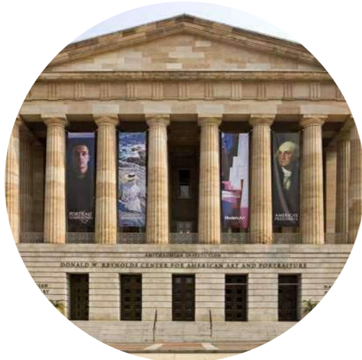
National Portrait Gallery