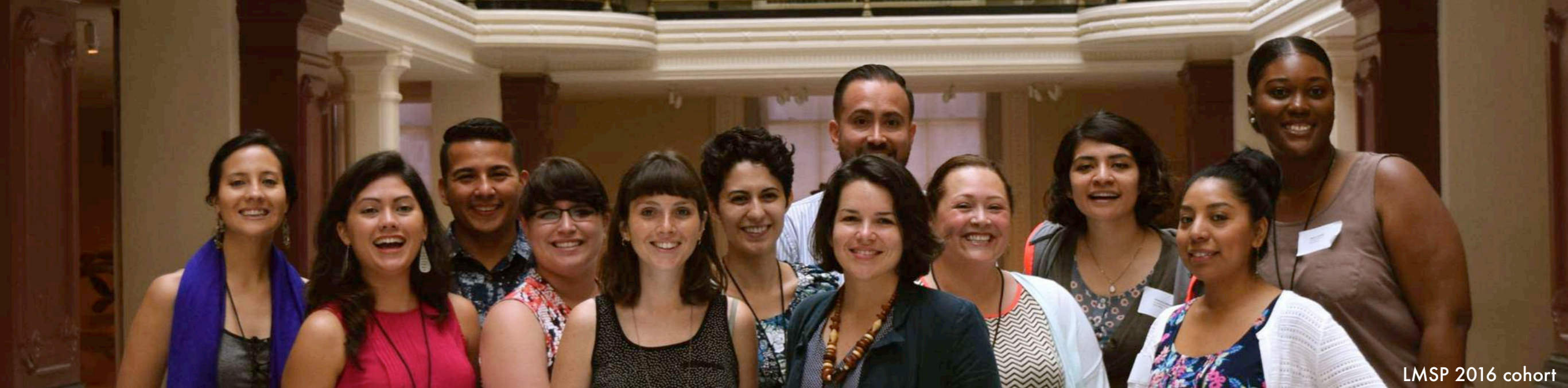
LMSP 2016 cohort