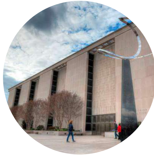
National Museum of American History