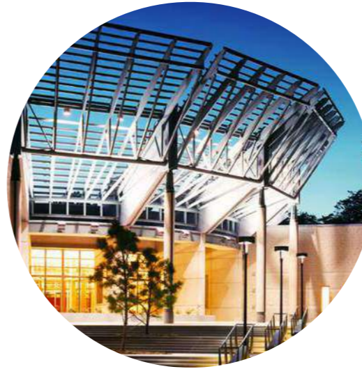
NMAI* Cultural Resources Center