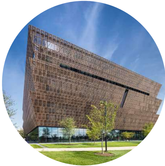
National Museum of African American History and Culture