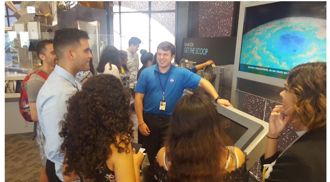
2018 Young Ambassadors visiting NASA Goddard