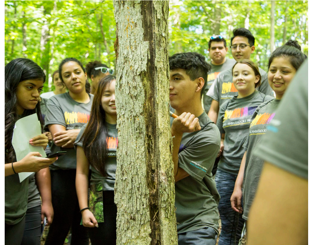
2018 Young Ambassadors at the Smithsonian Conservation Biology Institute