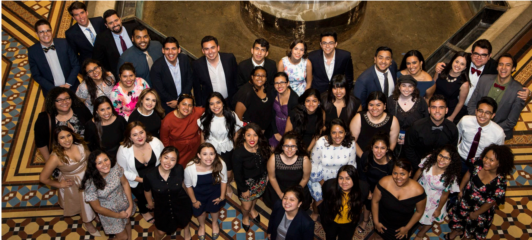
2018 Young Ambassadors and Alumni

The Young Ambassadors Program (YAP) is a national college preparatory and leadership program for graduating high school seniors that fosters the next generation of community-conscious Latino leaders in the arts, sciences, and humanities via the Smithsonian Institution and its resources.