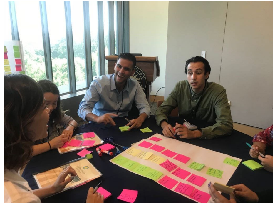
2017 Young Ambassadors at a Smithsonian Latino Center Workshop