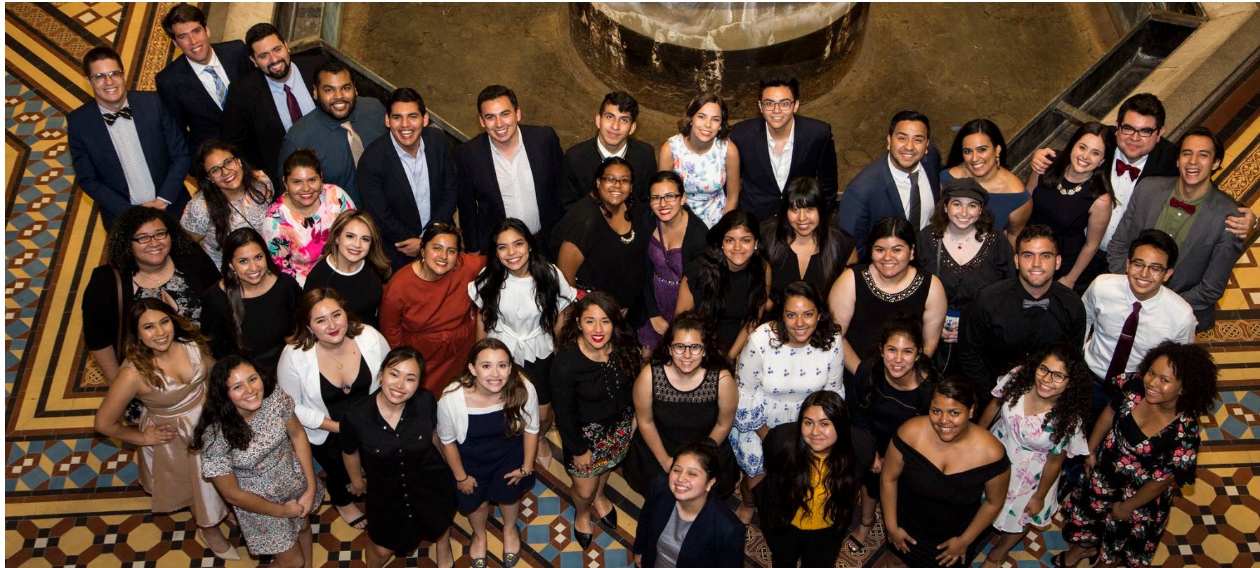
2018 Young Ambassadors and Alumni

The Young Ambassadors Program (YAP) is a national college preparatory and leadership program for graduating high school seniors that fosters the next generation of community-conscious Latino leaders in the arts, sciences, and humanities via the Smithsonian Institution and its resources.