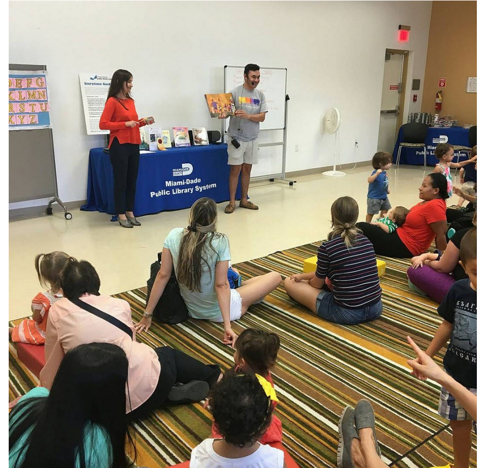
2017 Young Ambassador and Alumni leading a Story Time at a Miami Public Library