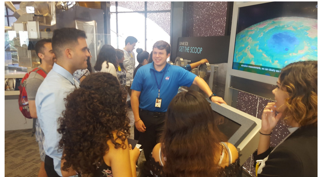
2018 Young Ambassadors visiting NASA Goddard