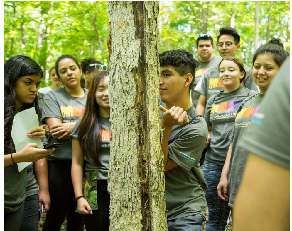
2018 Young Ambassadors at the Smithsonian Conservation Biology Institute