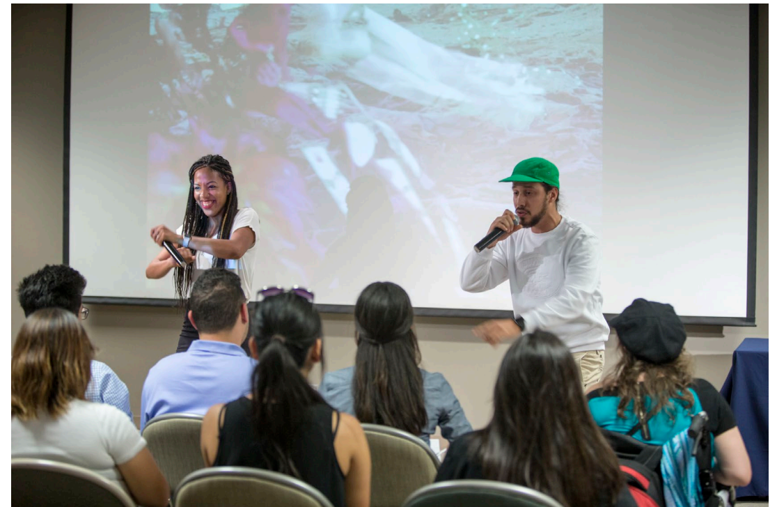
2017 Young Ambassadors Program Workshop with Circa '95