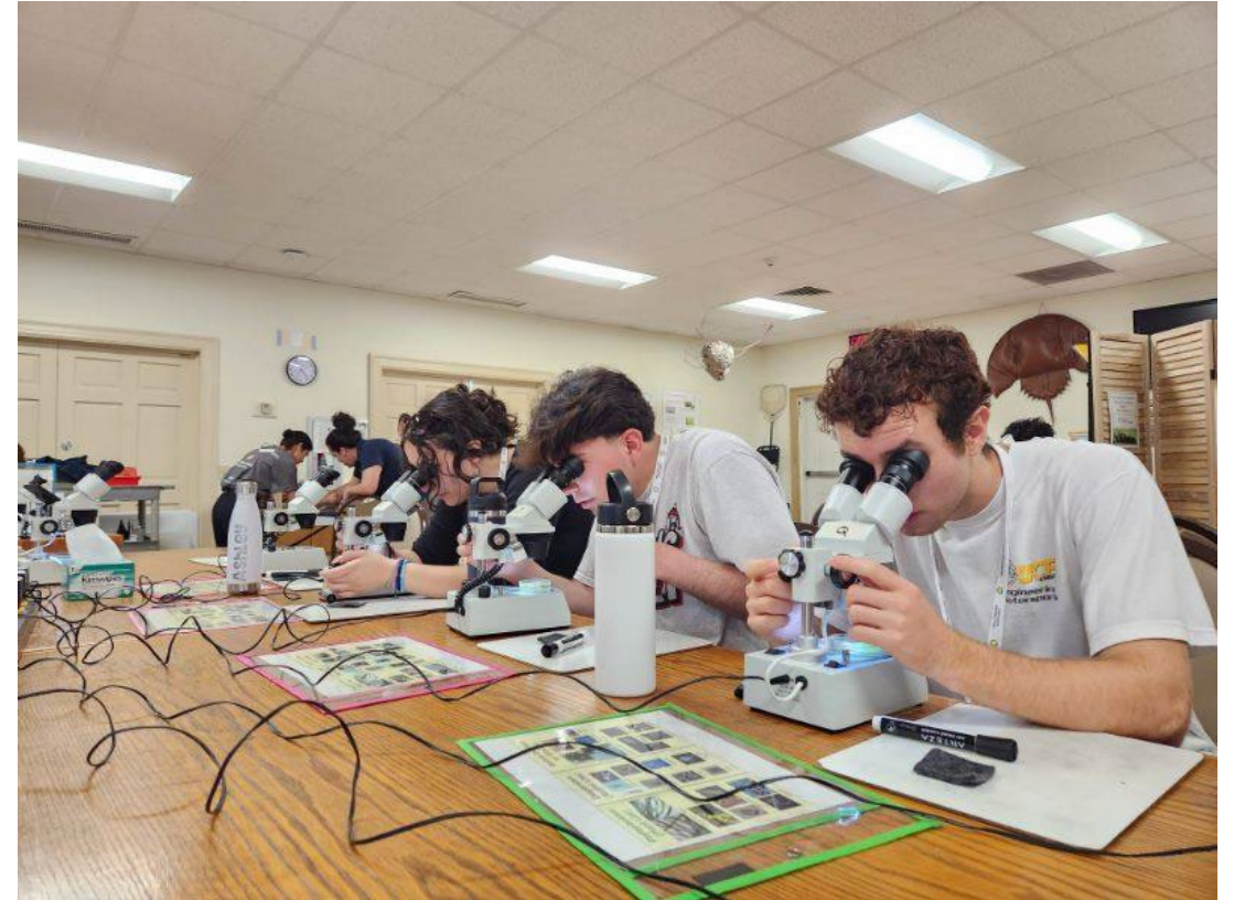
2023 Young Ambassadors at the Smithsonian Environmental Research Center