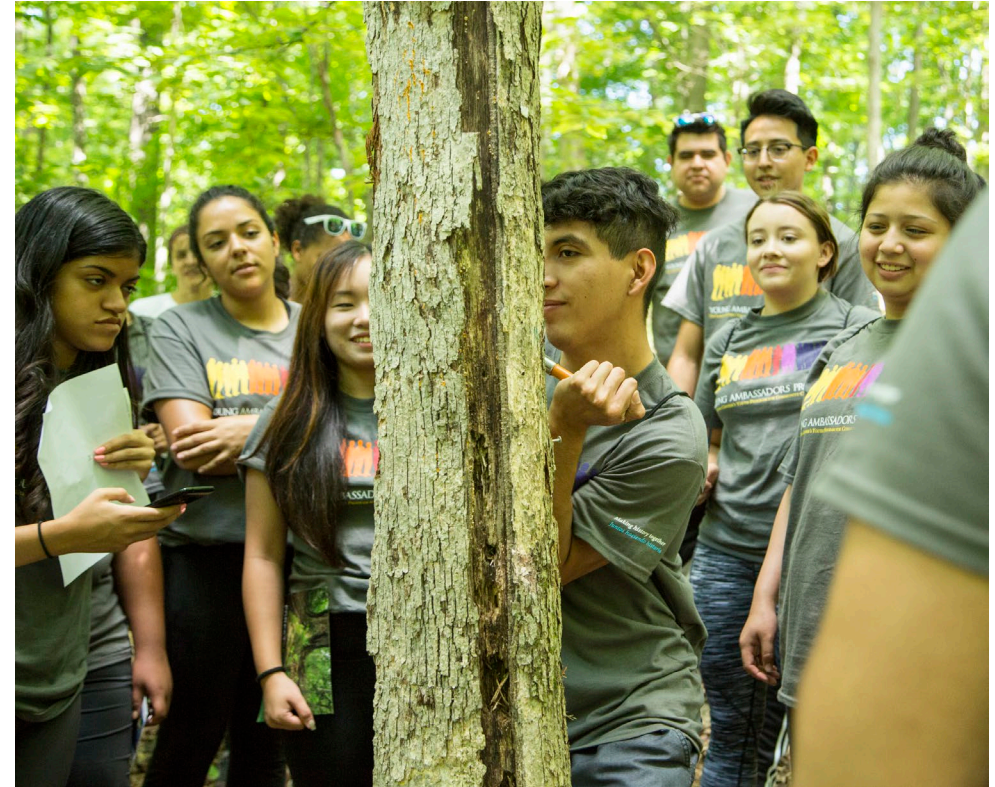
2018 Young Ambassadors at the Smithsonian Conservation Biology Institute