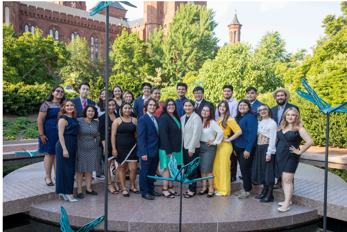
2022 Young Ambassadors and Alumni

The Young Ambassadors Program (YAP) is a national college preparatory and leadership program for graduating high school seniors that fosters the next generation of community-conscious Latino leaders in the arts, sciences, and humanities via the Smithsonian Institution and its resources.