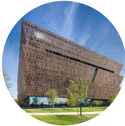
National Museum of African American History and Culture