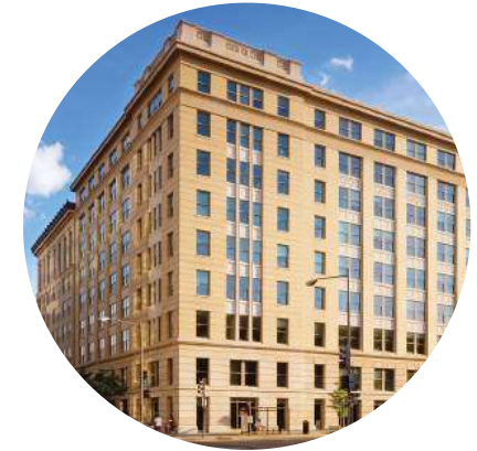
Archives of American Art