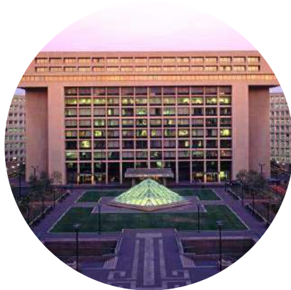
Smithsonian Institution Traveling Exhibition Services