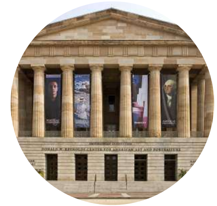
National Portrait Gallery