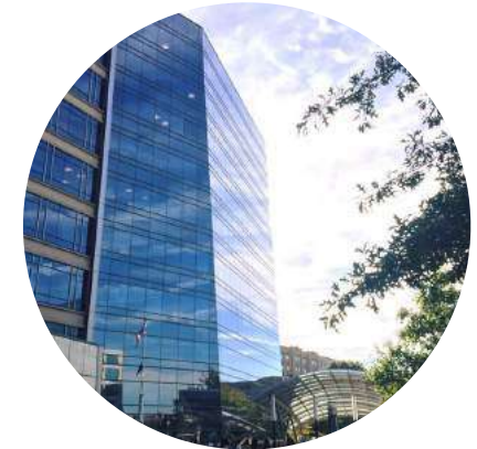
Smithsonian Latino Center