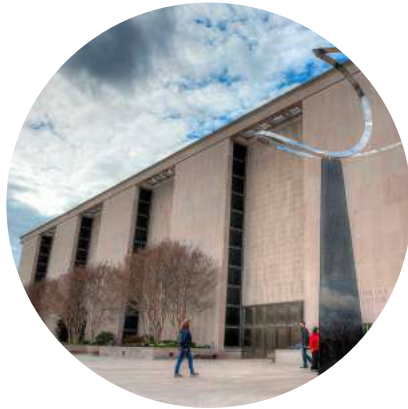
National Museum of American History